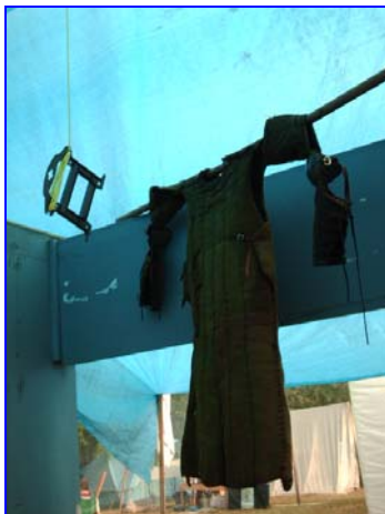
Gambeson drying.....a gain (l) and El-domere Polar Bear on the move before the Woods battle (r)