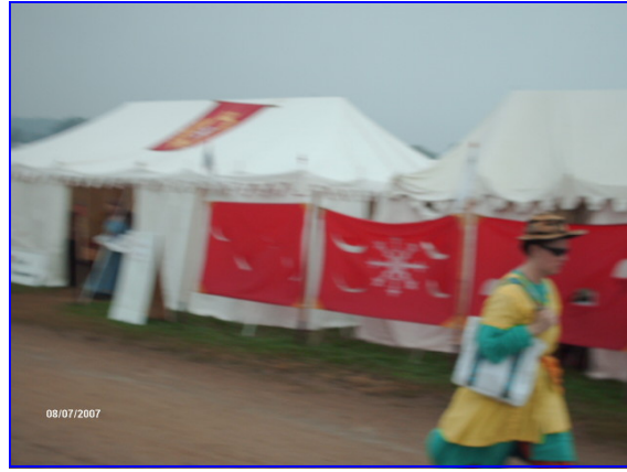
Always time for merchanting (l) while busy subject rushes in front of AÆthelmearc Royal