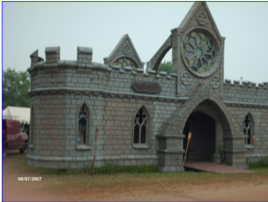
Clan Shadowlands (above) and Gladique Scoporium (below) have “sanctified” entrances to their camps.....