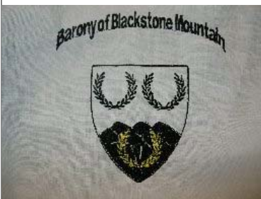
Above and right—examples of Apron designs for Aethelmearc Aprons Project.

We have the majority of the Kingdom's group's devices ready for use in a variety of machine formats. The last remaining few are waiting for graphics work to be done so they AE usable. It has taken us about 15 months to get the bulk of the work completed with approximately 4 of us working on it steadily and up to 10 at various times. While it