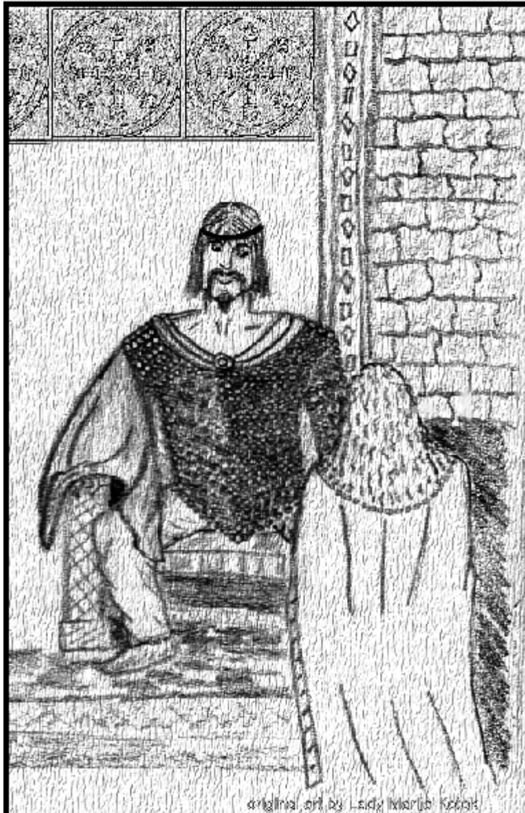
Artwork Helene Al Zarqua

Arrangements have been made with America's Best Value Inn (formerly Motel 6) at 11237 Shaw Ave., Meadville, PA 16335, (814) 724-6366, to hold a block of rooms for us. Those interested in staying Friday 4-13 and/or Saturday 4-14 should call and make their own reservations, stating that they are with the "SCA". As long as 10 rooms are booked, the double room rate will be $47.99 plus tax (less than 10 is $69.99 plus tax). This is a fairly new hotel, situated right at the Meadville exit of I-79 along US 322. It is right next to Applebee's and Country Fair, across the road from Cracker Barrel, Perkins, and Chovy's Italian Restaurant, and within a short drive of all the usual fast food joints, several gas stations, grocery stores, and Wal-Mart. The rooms are accessed from interior hallways, and the room includes Continental Breakfast, with at least one hot item. Check in is 3:00 PM (if you call that day you may be able to check in earlier) and check out is by noon.