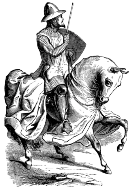
Fig. 16 —Knight in War-harness, after a Miniature in a Psalter written and illuminated under Louis le Gros.