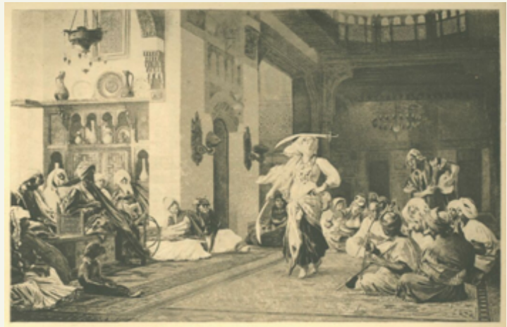
An Almeah Performing the Sword Dance - by Jean-Léon Gérôme, 1870. Earliest known record of a female dancer with a sword on her head.