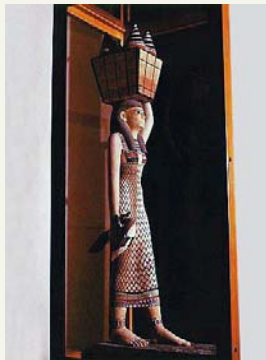
(left) Side view of a carved, wooden statue depicting a peasant girl holding a duck in one hand, and balancing a basket on her head, (11th dynasty), from Deir El Bahri, on exhibition at the Egyptian Museum, Cairo (1970).