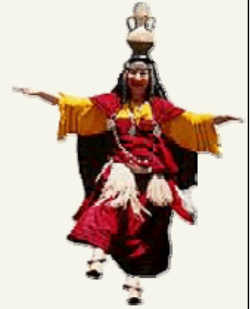
Traditional Tunisian Dancer

The oldest use of a balanced object is most certainly that of the basket or jug. From a practical point of view, a woman's neck and head are much stronger than her arms or shoulder muscles. There is no saying whether or not it started when baskets were invented, but it must have been close. From ancient times to modern day, all over the world, women carry baskets and jugs to walk far distances. That being said, we cannot say for certain when they began dancing with them. Today there are many dances across West Africa that use baskets as props, usually to illustrate a particular action in life, including balancing! To my knowledge, there are no examples of Middle Eastern dance involving baskets. In Tunisia, men and women dance with water jugs on their heads, usually while rhythmically swinging their hips. Afterwards, it is traditional to pour the water out to prove difficulty. The Pot Dance (Raqs al Jazur or Shaba) comes from the south of Tunisia, the islands of Djerba and Kerkennah. Both men and women perform this feat of balance at weddings. For women, the traditional dress is a Milaya, or several yards of fabric wrapped in a fashion similar to that of a toga.