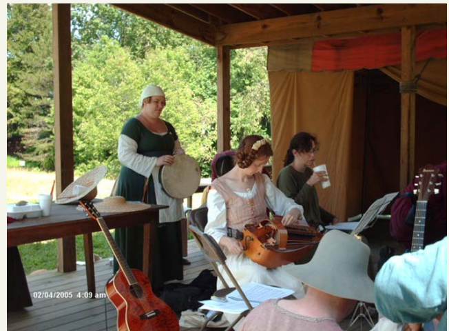
Tabla and Hurdy-gurdy