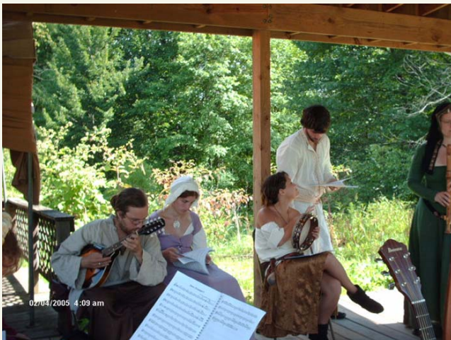
Tuning up for the group session