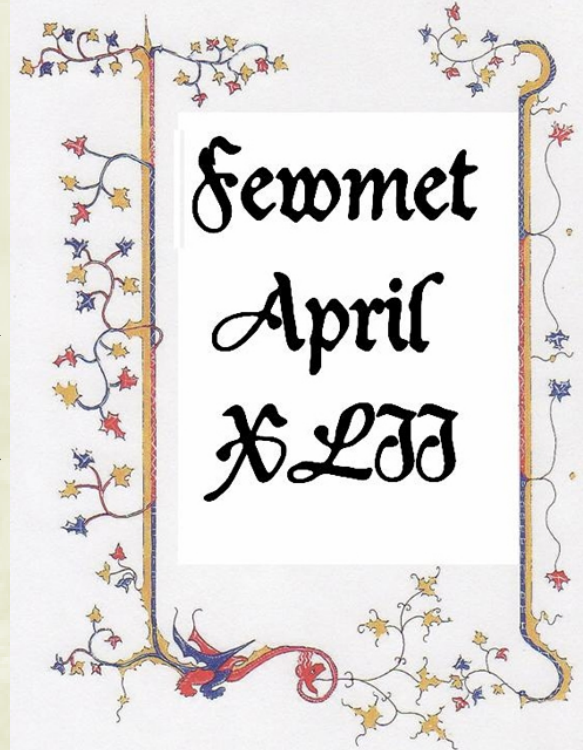
Artwork by THL Collette de Paris