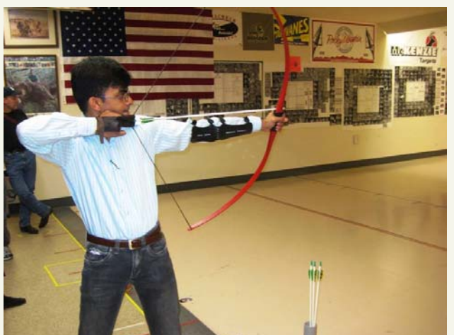
Naumene shooting Archery