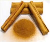
Figure 2. Cassia (l) and Cinnamon (R)

Let me point out that in period, cinnamon or canel would have likely been used. I have used cassia since it was affordable and readily available for me. I used cassia sticks. For a comparison of the appearance of cassia and true cinnamon, see Figure 2.